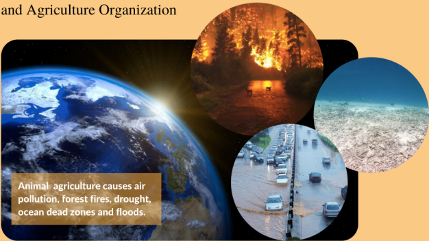
Animal agriculture causes air pollution, forest fires, drought, ocean dead zones and floods.

Animal products are significantly more resource-intensive than plant-based foods. Eating more vegan food conserves water and reduces air/water pollution, prevents species extinction, cuts greenhouse gas emissions, and reduces livestock emissions. Eating more plant-based foods reduces energy consumption, helps stabilize the ocean and replenishes the sea, and protects the rainforest. Production of a meat-based diet requires more than ten times the water required for a non-vegan diet. Studies show that adopting a vegan diet can be enough to stop and reverse the harmful effects of climate change including rising sea levels, floods, melting glaciers, and droughts. If everyone on the planet would go vegan, livestock emissions would stop entirely, single-handedly ending the biggest contributor to climate change. "Raising livestock for human consumption generates nearly 15% of total global greenhouse gas emissions, which is greater than all the transportation emissions combined." -United Nations Food and Agriculture Organization